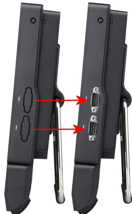
Shuttle XPC all-in-one P20U/P22U before and after the installation of PCP21